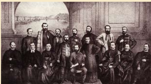
Members of the delegation that submitted the Memorandum to the Hungarian Diet