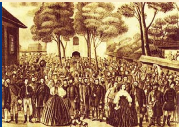
Contemporary picture of the Memorandum assembly with 5,000 participants

But although the requirements of the Memorandum were not met, the document was tremendously important for the identity, self-awareness and national development of the Slovak people. It demonstrated the ability and readiness of Slovak leaders to act on behalf of their national interests and to put them across with the cogent political, theoretical and legal arguments. The Memorandum programme (especially its principles of national identity and equality) was, until the break-up of the Austro-Hungarian Empire in 1918, the main platform for addressing the Slovak question and issues of national emancipation.