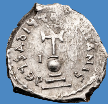
A rare Byzantine hexadrachm minted during the reign of Emperor Heraclius II (610-641); it was part of a unique treasure trove found in Zemiansky Vrbovok village in Krupina District in 1937