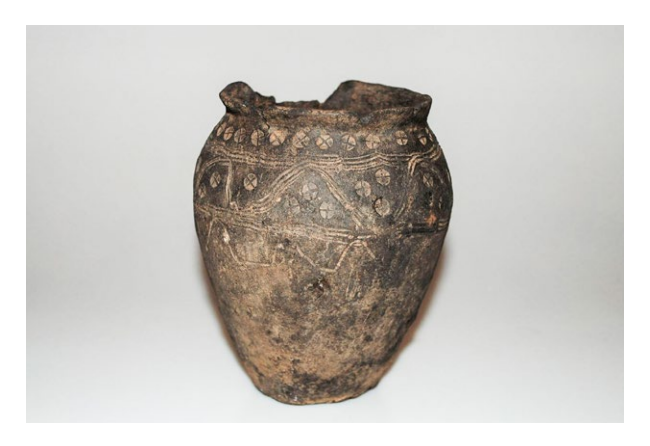
A type of Slavic vessel dating from between the 6th and 8th centuries AD, from a burial site at the Bratislava borough of Devínska Nová Ves

Tensions between Slavs and Avars within the Khaganate grew to the point that the Slavs rose up against their rulers, with their revolt plotted and launched by experienced military veterans. The uprising swept through the western part of the Khaganate and set in motion the rebellious Slavic tribes, who soon had a transformative effect on central Europe and the northern Balkans.